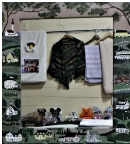
Di Ferrabee –mirror